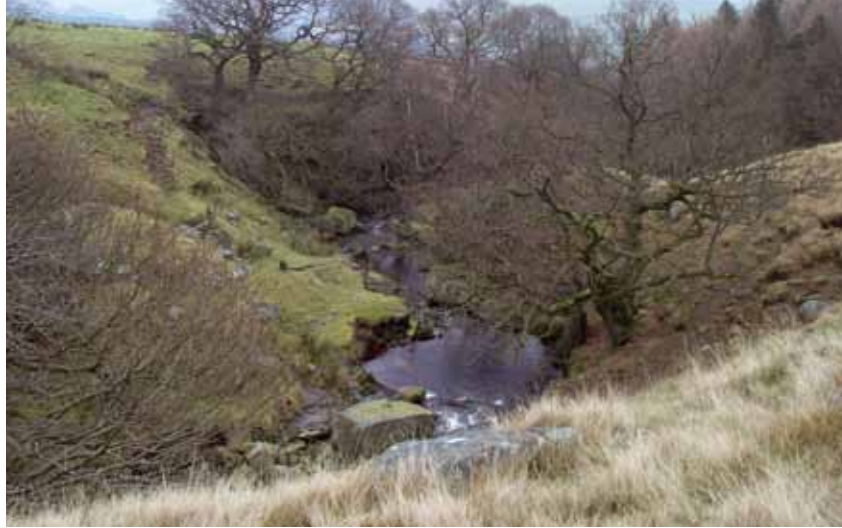
▷ Blayshaw Beck. M. Adamson

H. ochraceum always at water level, then Solenostoma sphaerocarpum (= Jungermannia sphaerocarpa ), Scapania undulata and Pellia epiphylla , with patches of Dichodontium pellucidum and D. palustre . In the side gill these plants are replaced by pure mats of Nardia compressa .