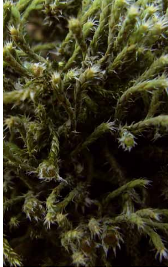
△ Hedwigia stellata at its only site at Studfold, atop a gritstone wall. M. Adamson

Grimmia trichophylla and Dicranoweisia cirrata pick out the gritstone walls, which are richest in the limestone area of the north and east of the site, those to the south and west being almost completely barren. Grimmia pulvinata and Schistidium crassipilum identify those walls incorporating limestone boulders. As an example of the heterogeneous nature of the walls, we have one colony of Hedwigia stellata in one of its few Yorkshire sites, sitting on top of a gritstone